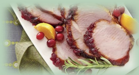
Cranberry-Chipotle Ham Serve this wonderful dinner for Christmas